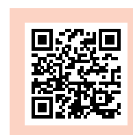
Scholarship and Financial Aid

Your application for enrolment into Swinburne Sarawak will be assessed for eligibility to our range of scholarships and bursaries. Applicants who are eligible will be notified via an official Scholarship Offer Letter.