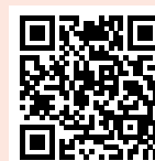
Scholarship and Financial Aid

The University reserves the right to alter or amend the information. For updated scholarships and bursaries information, please visit our scholarship website by scanning the QR code.